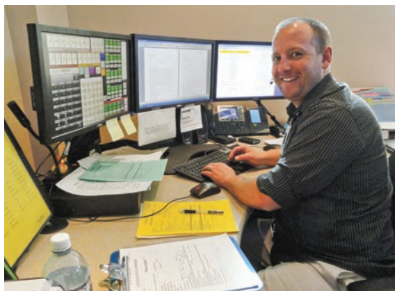
Communications Center employees work to coordinate flights.